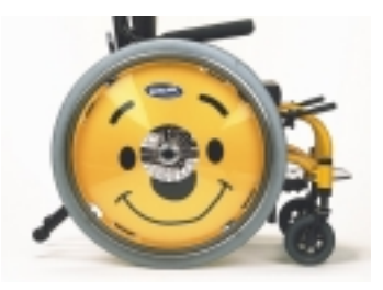
Three new choices available; Smiley (shown), Spider and Flowers (not shown)